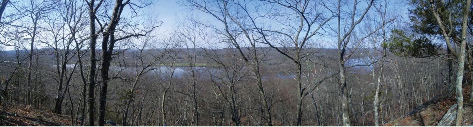
Brainerd Quarry, Haddam, Looking West